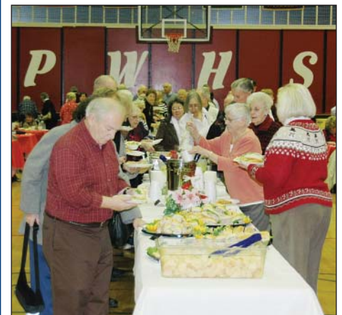
Senior citizens enjoy the luncheon that followed a special performance of the PWHS Winter Concert.